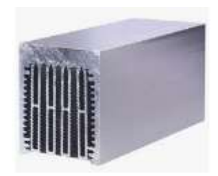
Figure.2. 6.heat sink

The heat sink dissipates heat generated by the voltage regulator and other components, preventing overheating and ensuring reliable operation. Heat management is critical, especially in power supplies with higher output currents.