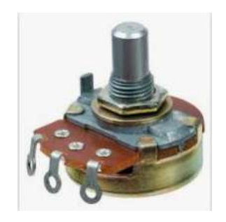
Figure.2. 5. potentiometer

Function: The potentiometer is used to adjust the output voltage of the power supply. It provides a variable resistance that changes the reference voltage for the adjustable voltage regulator, thereby varying the output voltage.