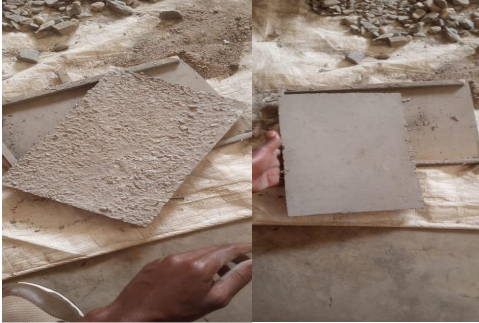
Figure 3.5 final product

Tiles made from sawdust can have a natural, textured appearance depending on the sawdust source and manufacturing process. The finish can range from matte to glossy, depending on surface treatments applied during production.