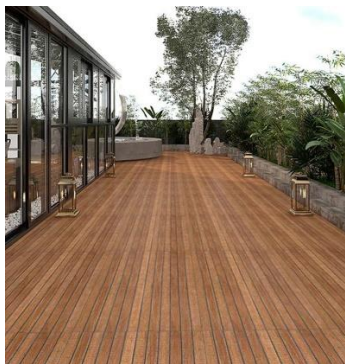
Figure 2. 3 pressed tiles

C) Pressed Tiles: Sawdust can be pressed and molded into tile shapes under high pressure and temperature. This method creates tiles that are dense and durable, suitable for both indoor and outdoor use.