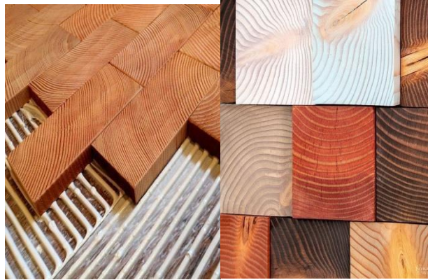
Figure 2. 1 the laying tiles

B) Bio composite Tiles: Bio composite tiles are a specific type of composite tile where natural fibers, including sawdust, are combined with a biodegradable resin or binder. These tiles emphasize sustainability and biodegradability.