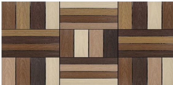
Figure 2. 2 TILES

B) Bio composite Tiles: Bio composite tiles are a specific type of composite tile where natural fibers, including sawdust, are combined with a biodegradable resin or binder. These tiles emphasize sustainability and biodegradability.