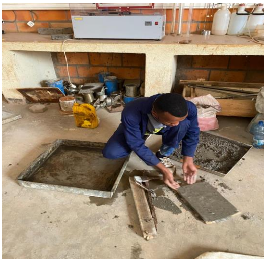
Figure 3.2 pleasing saw dust blend in formwork

Ensure consistent molding conditions across all experimental samples.