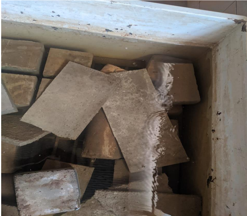
Figure 3.3 curing tiles