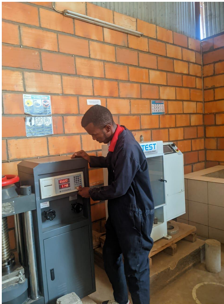
Figure 3.4 compressive bearing capacity

This test measures the maximum compressive load a tile can withstand before failure. It is crucial for assessing the structural integrity and load-bearing capacity of the tiles.